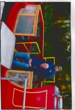
Boat Crew Demonstrate Wheelchair Access

Heulwen is the Welsh word for sunshine , so is an appropriate name for a Trust dedicated to bringing enjoyment to those with special needs.