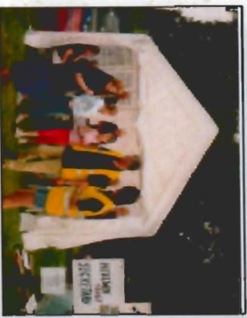
Control Tent At The Country & Western Festival

The Trust was formed in 1985, and provides free trips on the Montgomery Canal. To date, some 45,000 people have enjoyed these trips.