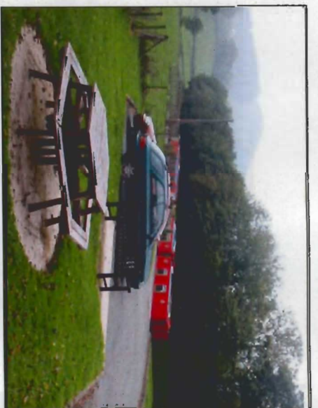
Picnic Area at the Wharf

The Trust is happy to tailor trips to suit the needs of individual groups. We recommend a minimum of two hours, but this can be extended up to five as required.