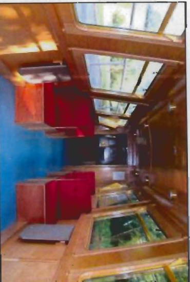
Interior of Heulwen III, showing flexible space for wheelchairs

Toilets are on board for both carers and their charges